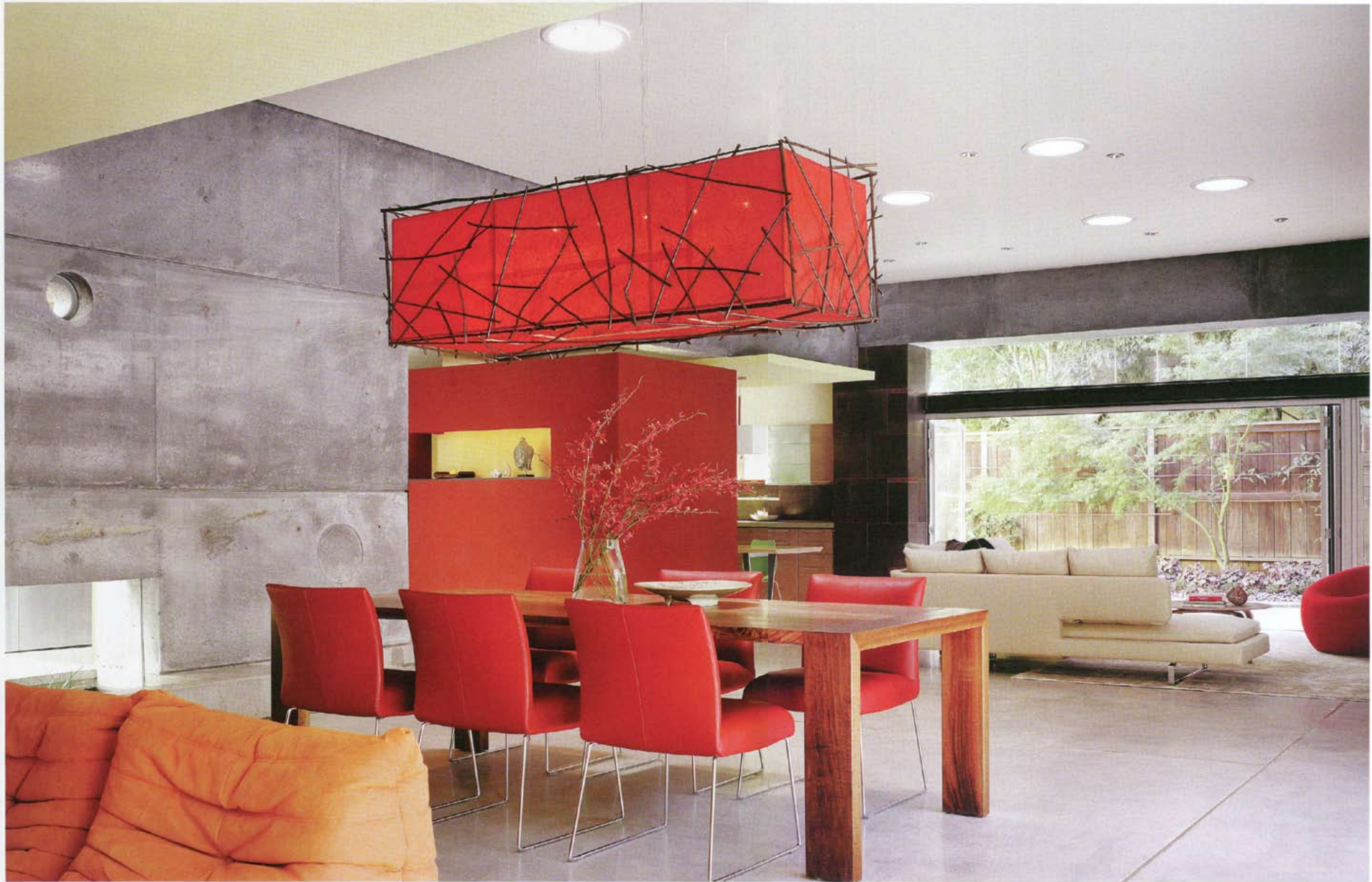
POP OF COLOR An orange Ligne Roset sofa and entry wall made of red Japanese plaster by Thom Bruce complement this open space with bright flattering hues.