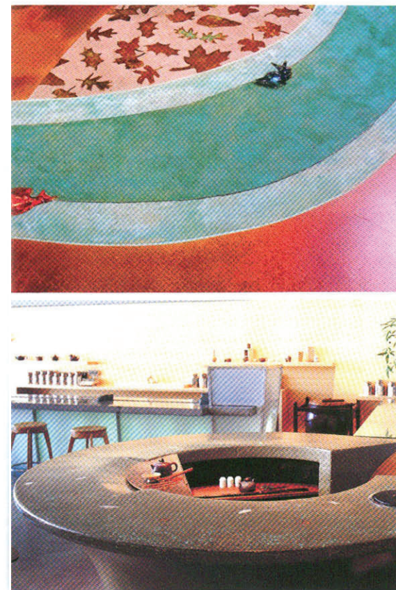
Top left & top right photos by Acanthus Inc.

One of the most exciting aspects of concrete's renaissance is the practically limitless array of colours available as a result of new, non-toxic, water-based stains. Penetrating the surface, these easy-to-apply stains offer UV stability and wear-resistance and can be combined with dyes to produce an even greater range of vibrant, custom hues including a