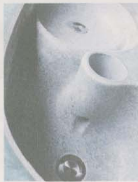
SHAPELY: An overflow sink created by DeWulf Concrete.

had been cobbled together, and the effect was "like walking on some rocky surface," Cheng says.