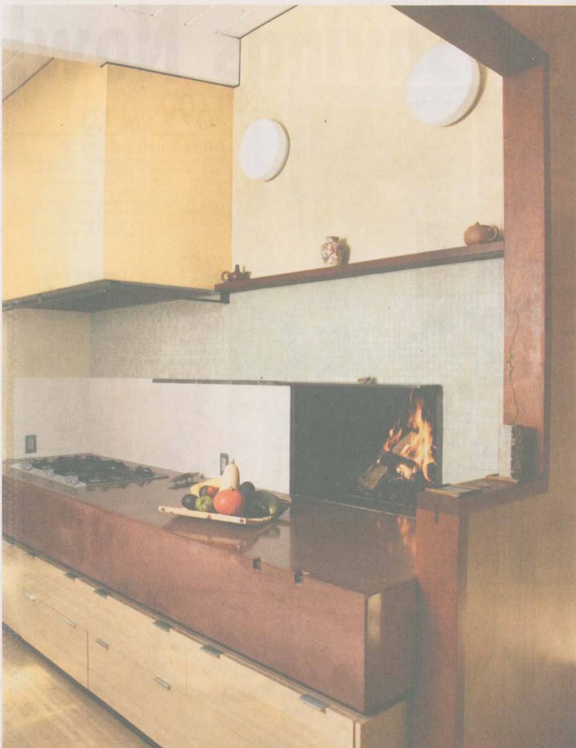
ECLECTIC CHOICES: In the kitchen of a Berkeley home, Cheng topped bamboo cabinets with a blocky counter of mottled concrete. White and celadon wall tiles create a cool contrast with the ruddy concrete surface.